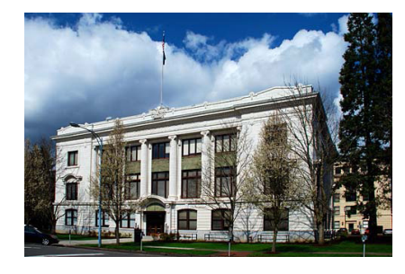
The Oregon Supreme Court Building