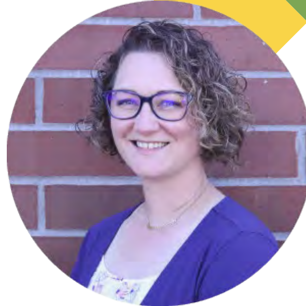
Melanie Kebler Mayor City of Bend