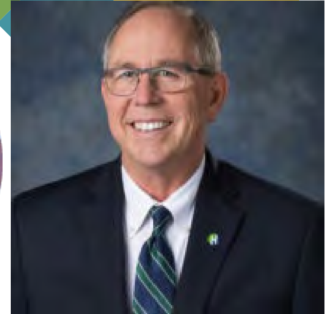
Steve Callaway Mayor City of Hillsboro