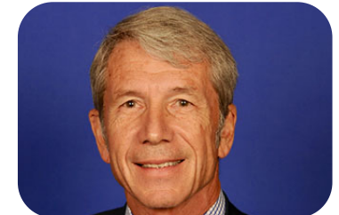
Representative Kurt Schrader