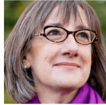
Rep. Andrea Salinas (D-Lake Oswego)