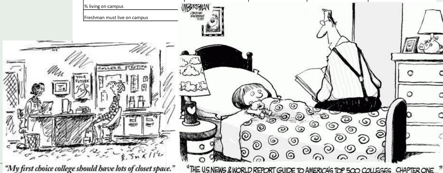
"My first choice college should have lots of closet space."