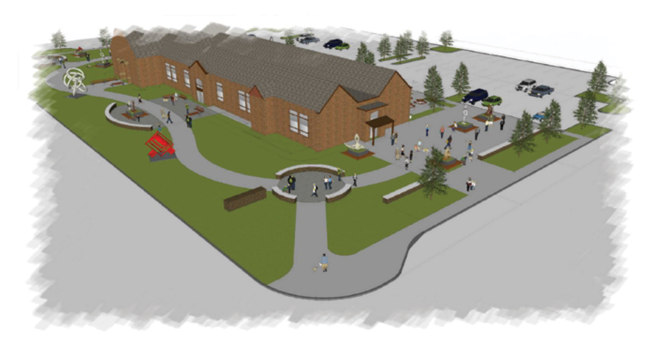
South Site Entry w/ Public Sidewalk & Pedestrian Node

Fund, which includes lottery-backed bonds as well as general fund dollars and appropriations through the Department of Administrative Services. The money will be available for project reimbursement in spring of 2021 and, in the meantime, the cultural center's fundraising campaign continues.