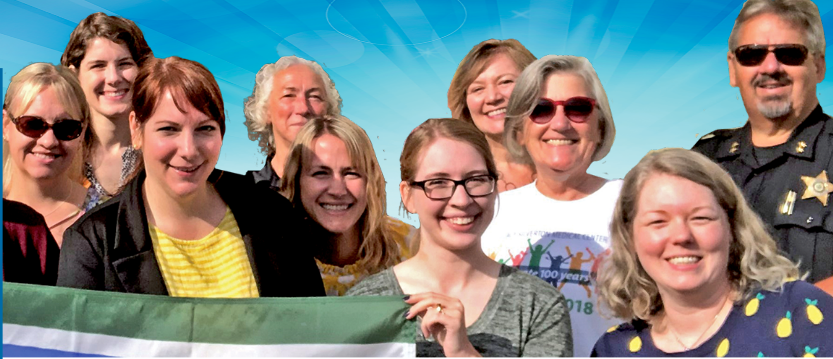
City of Silverton Employees