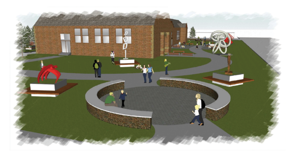
North Pedestrian Node w/ Tree Display, Seat walls & Art Pedestals