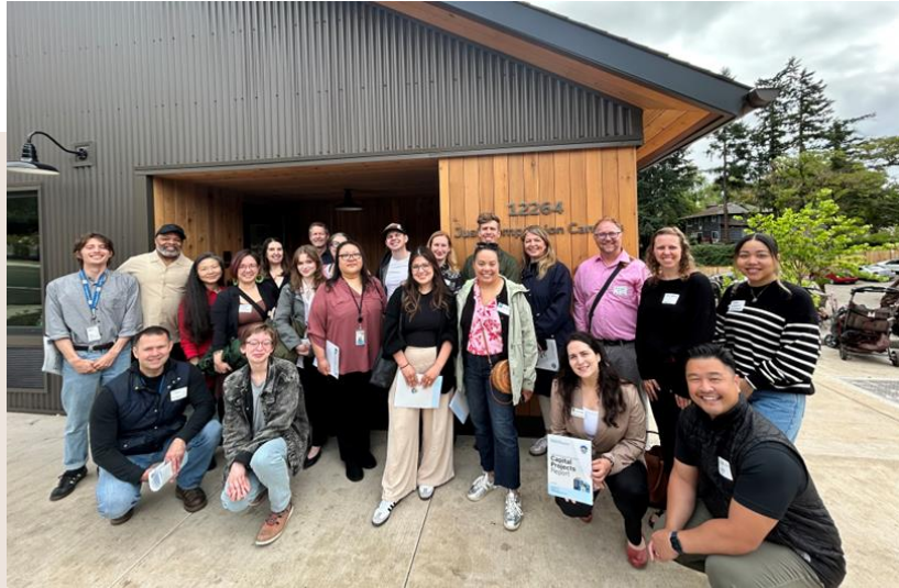
Supportive Housing Services (SHS) Built Infrastructure Tour with government & non-profit leaders in the field, pictured here at Just Compassion's Tigard shelter and access center