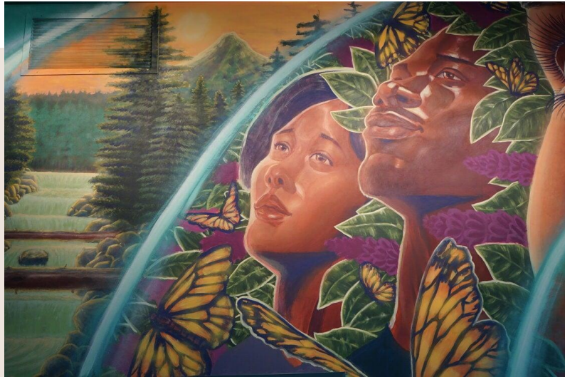
Mural inside the shelter, a nod to the trauma informed elements of the shelter (trees/natural lighting)