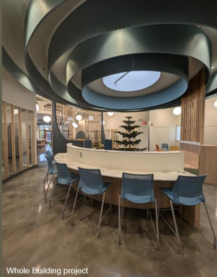
Whole Building project